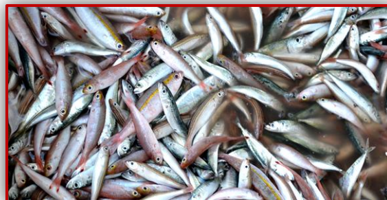
Scientific name: Caesionidae English name: Fusilier Dhivehi name: Muguran