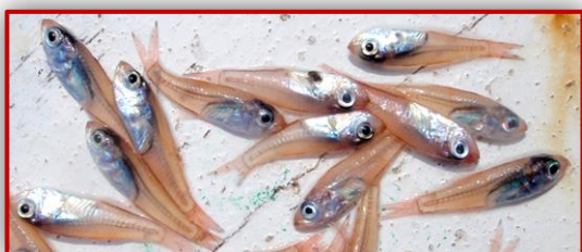
Scientific name: Apogonidae English name: Cardinal fish Dhivehi name: Boadhi