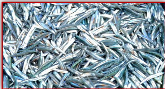
Scientific name: Spratelloides gracilis English name: Silver sprat Dhivehi name: Rehi

Skipjack, small yellowfin and bigeye tuna are caught using pole-and-line. Fishers use livebait to attract and catch the tuna. This livebait is caught using lift nets from the inshore waters of the Maldives atolls.