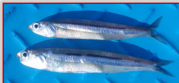
Scientific name: Encrasicholina heteroloba English name: Anchovy Dhivehi name: Miyaren