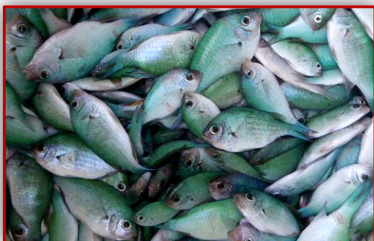
Scientific name: Chromis viridis English name: Blue-green damsel Dhivehi name: Nilamehi